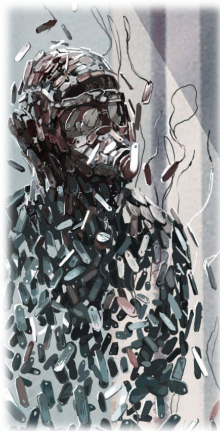
Concept drawings as an impression have been made by epoxygieten.nl